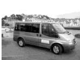
8 & 16 seat minibuses