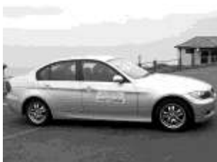
4 seat BMW cars

Please call for people carrier and minibus prices.