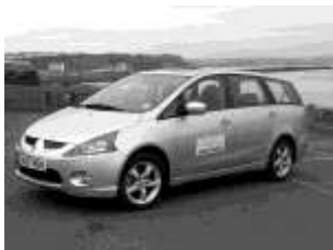
6 seat people carriers