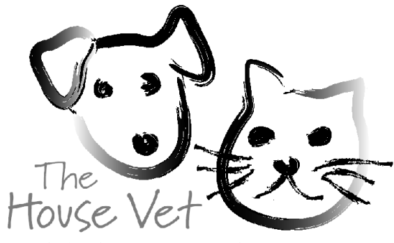
Professional Health Care for your pets in their home

A healthy dog or cat is no accident. It takes commitment from you to provide your pet with a healthy lifestyle and regular veterinary care.